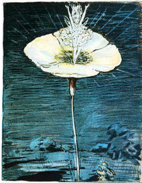
The Fairy Flower

"I've brought you a new playfellow," the Fairy said. "You must be very kind to him and teach him all he needs to know in Rabbitland, for he is going to live with you for ever and ever!"